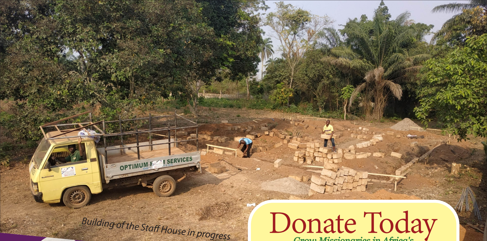
Building of the Staff House in progress